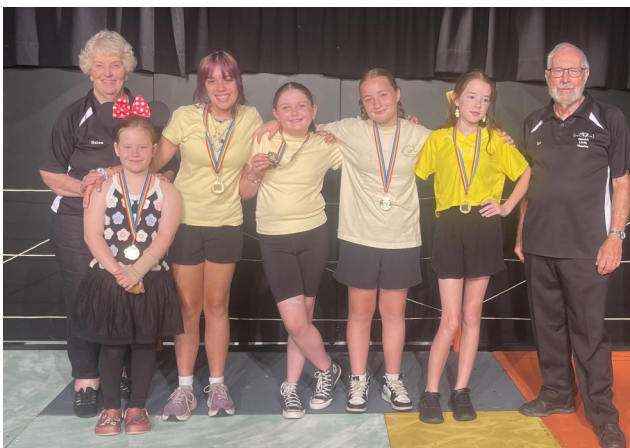
The winning team with the adjudicators ...

The Juniors, Young Theatricals and Daytime Theatre Troupe have finished for the year but will resume revitalized and refreshed in 2026.