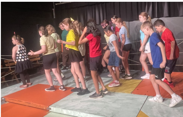
The Juniors entering the fray ...

The Junior actors have finished their formal classes for the year with a successful Theatre Sport Smackdown. Those who attended would have been impressed with how far these young people have come this year.